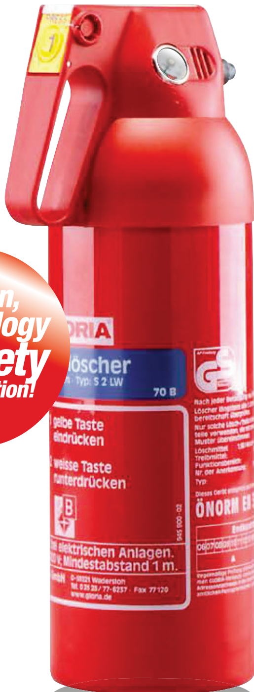
GLORIA S 2 LW

Design, Technology & Safety in perfection!